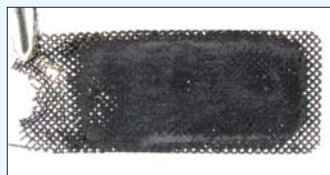
Leading Oil Brand