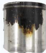
Leading Oil Brand