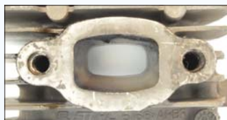
AMSOIL SABER Professional