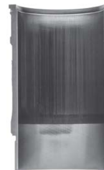
Severely Scuffed Liner