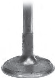
Intake Valve after P.i. Treatment