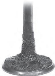
Intake Valve before P.i. Treatment