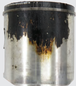
Leading Oil Brand 300 Hours