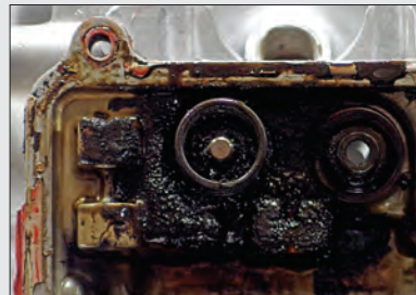
Leading Oil Brand 125 Hours