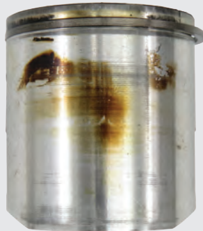
AMSOIL SABER Professional 300 Hours

Following 300 hours of professional-use testing in STIHL* string trimmers at the manufacturer mix ratio of 50:1, SABER Professional kept pistons and rings virtually free of carbon and wear (see the picture on the top), while use of a leading oil brand caused significant carbon buildup around the ring area (see the picture on the bottom). This engine is nearing the failure point.