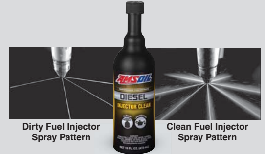
Dirty Fuel Injector Spray Pattern

Diesel Injector Clean also provides added lubricity, helping protect fuel pumps and injectors against premature failure.