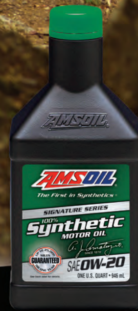
SYNTHETIC MOTOR OILS