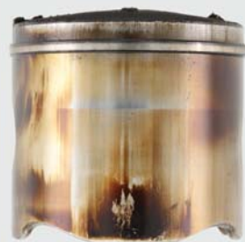
ECHO Power Blend @ 50:1