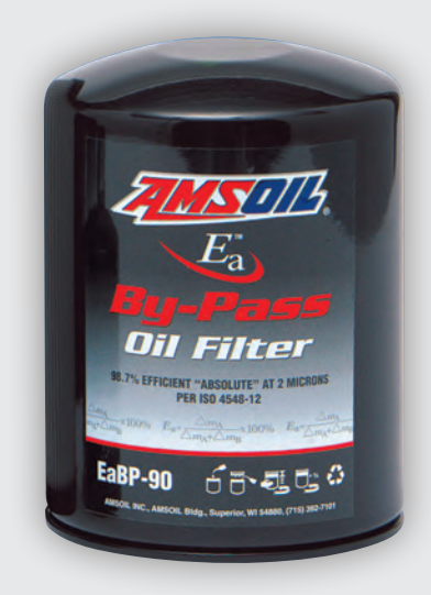
EaBP90 • EaBP100 • EaBP110 • EaBP120

AMSOIL Ea Bypass Oil Filters provide maximum filtration protection against wear and oil contamination. Working in conjunction with the engine's full-flow oil filter, AMSOIL Ea Bypass Filters operate by filtering oil on a "partial-flow" basis. They draw approximately 10 percent of the oil sump's capacity at any one time and trap the extremely small, wear-causing contaminants that full-flow filters can't remove. AMSOIL Ea Bypass Filters typically filter all of the oil in the system several times an hour, so the engine continuously receives analytically clean oil.